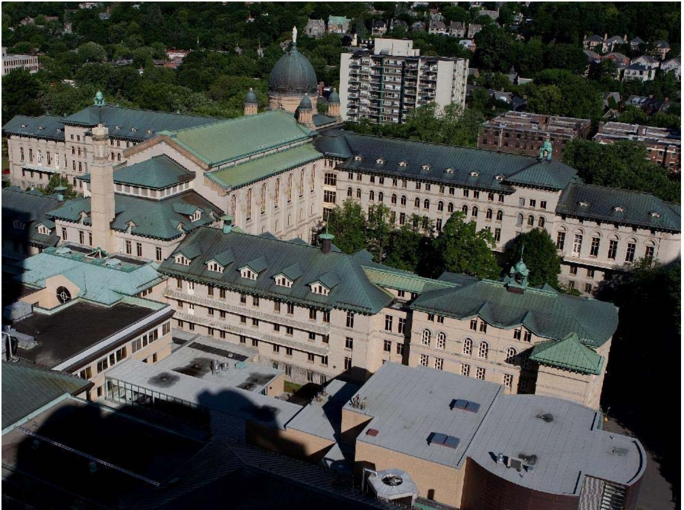
The Dawson College building (formerly the Motherhouse) as seen in this aerial cityscape view taken from the roof of the Alexis Nihon Plaza, pictured in